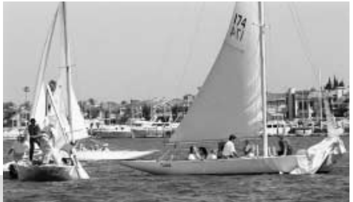
Two boats attempting to occupy the same space of water at the same time!